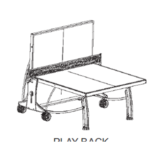
Norme EN 14468-1 (classe C)